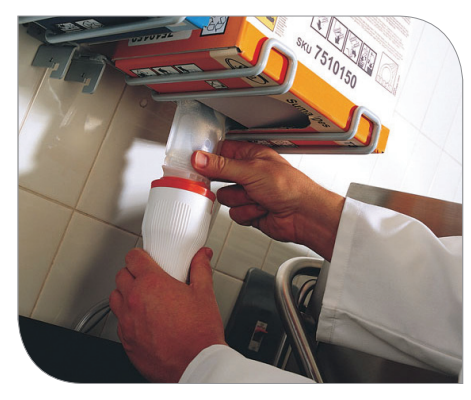
B. Connect using the product specific connector