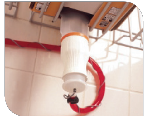
A. Open the box and place onto the rack